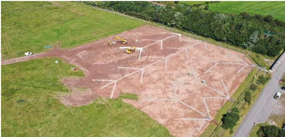
Photo showing progress of STIM early works 'herringbone drainage' installation at the Repository site.

Recent learning has been taken from our commitment to use white noise beepers for our onsite equipment wherever possible. Two were found to not have these fitted, which has now been rectified.